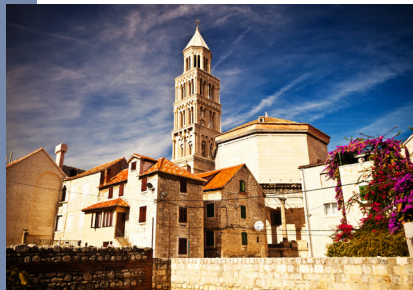
St. Blaise Church